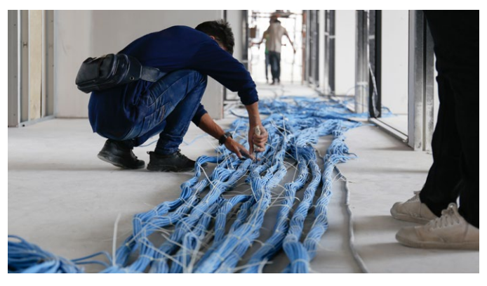
Figure 1 · Typical Legacy Chollenges